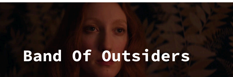
Band Of Outsiders